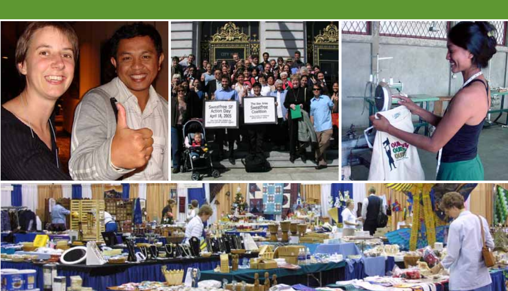
A Guide for Presbyterian Camps, Conference Centers and Congregations